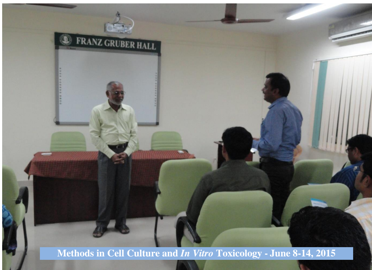
Methods in Cell Culture and In Vitro Toxicology - June 8-14, 2015