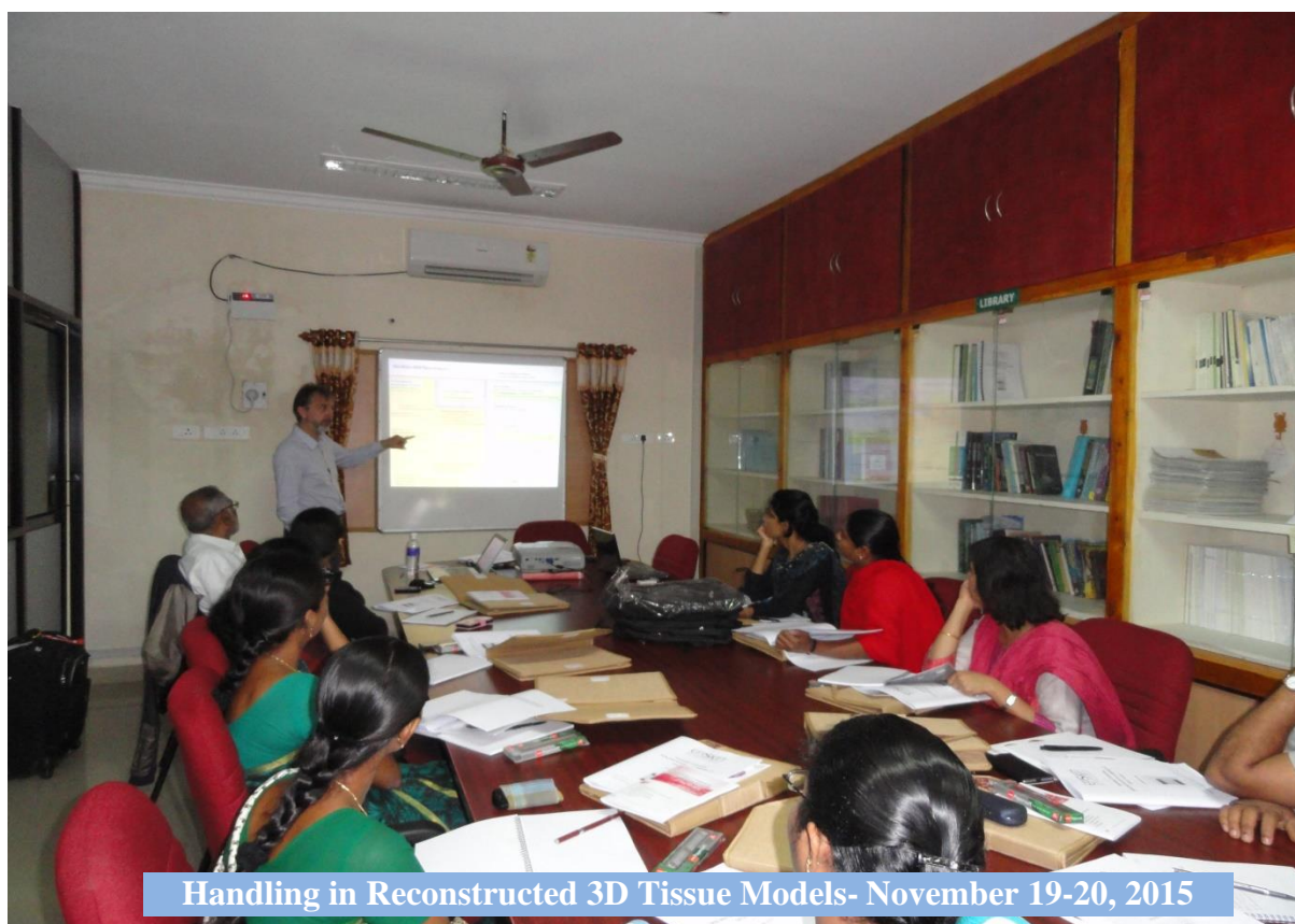
Handling in Reconstructed 3D Tissue Models- November 19-20, 2015