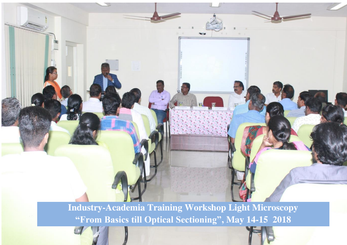
Industry-Academia Training Workshop Light Microscopy “From Basics till Optical Sectioning”, May 14-15 2018