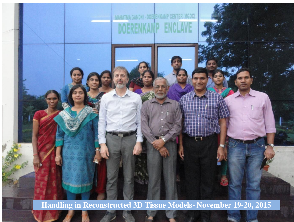
Handling in Reconstructed 3D Tissue Models- November 19-20, 2015