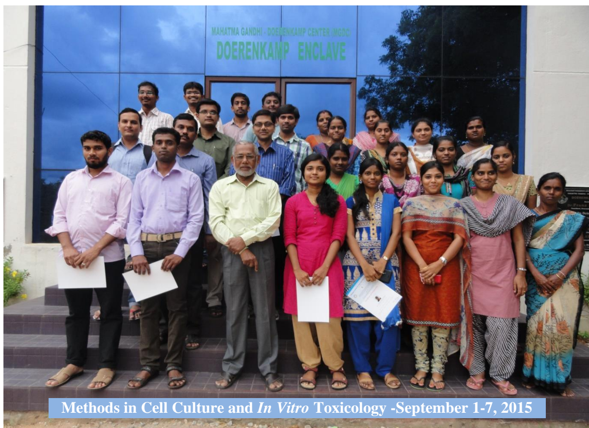
Methods in Cell Culture and In Vitro Toxicology -September 1-7, 2015