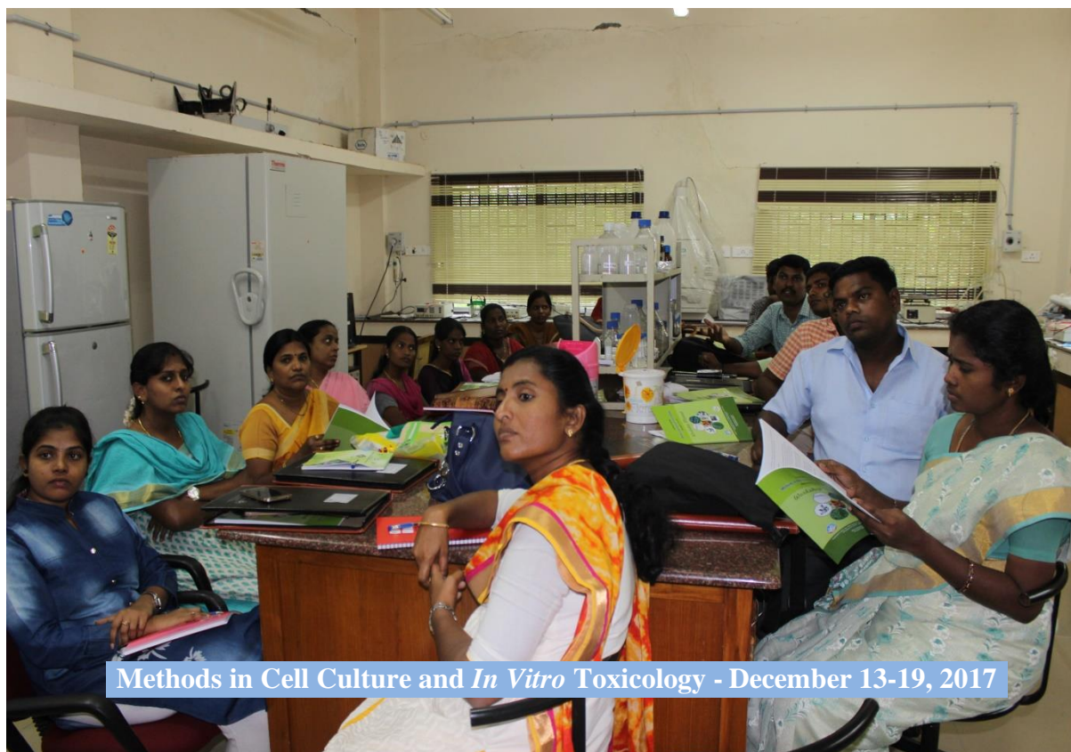
Methods in Cell Culture and In Vitro Toxicology - December 13-19, 2017