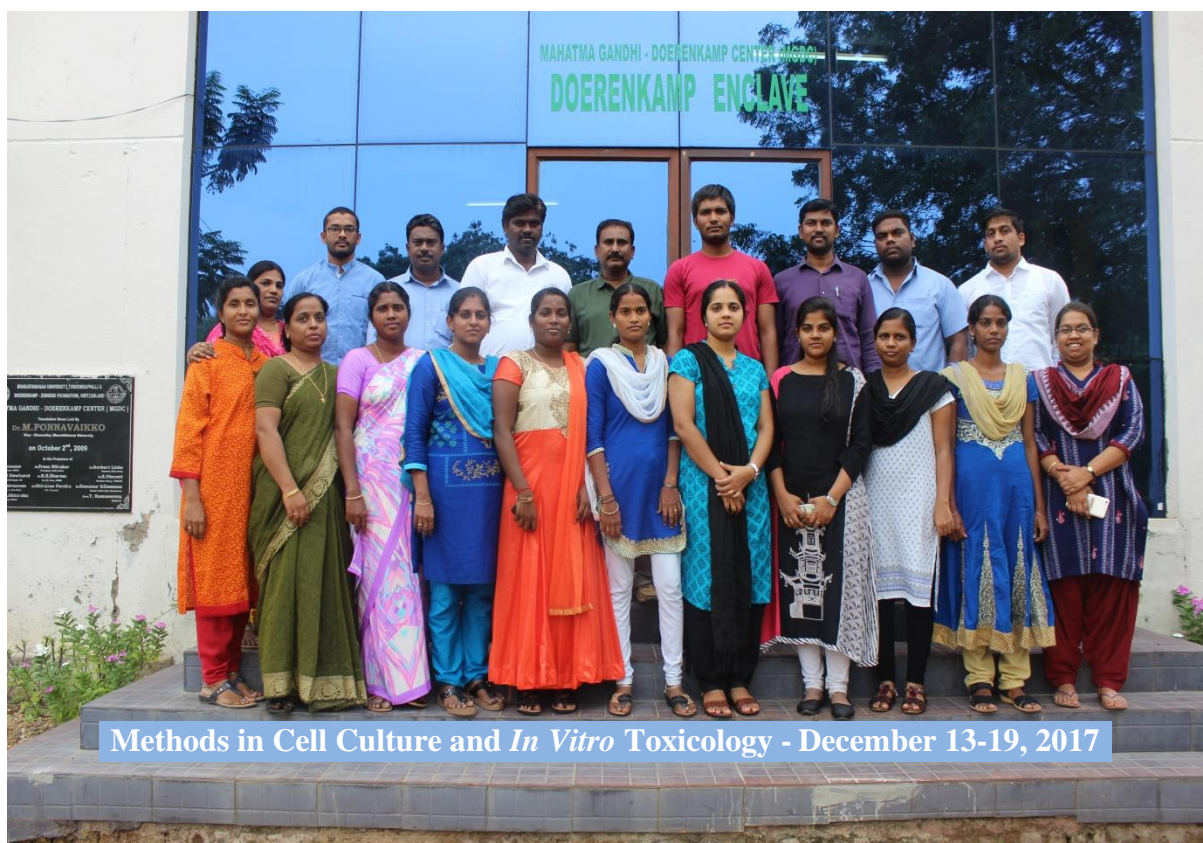
Methods in Cell Culture and In Vitro Toxicology - December 13-19, 2017