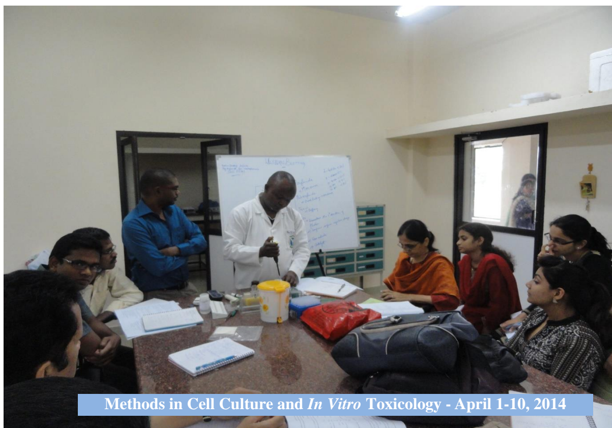
Methods in Cell Culture and In Vitro Toxicology - April 1-10, 2014