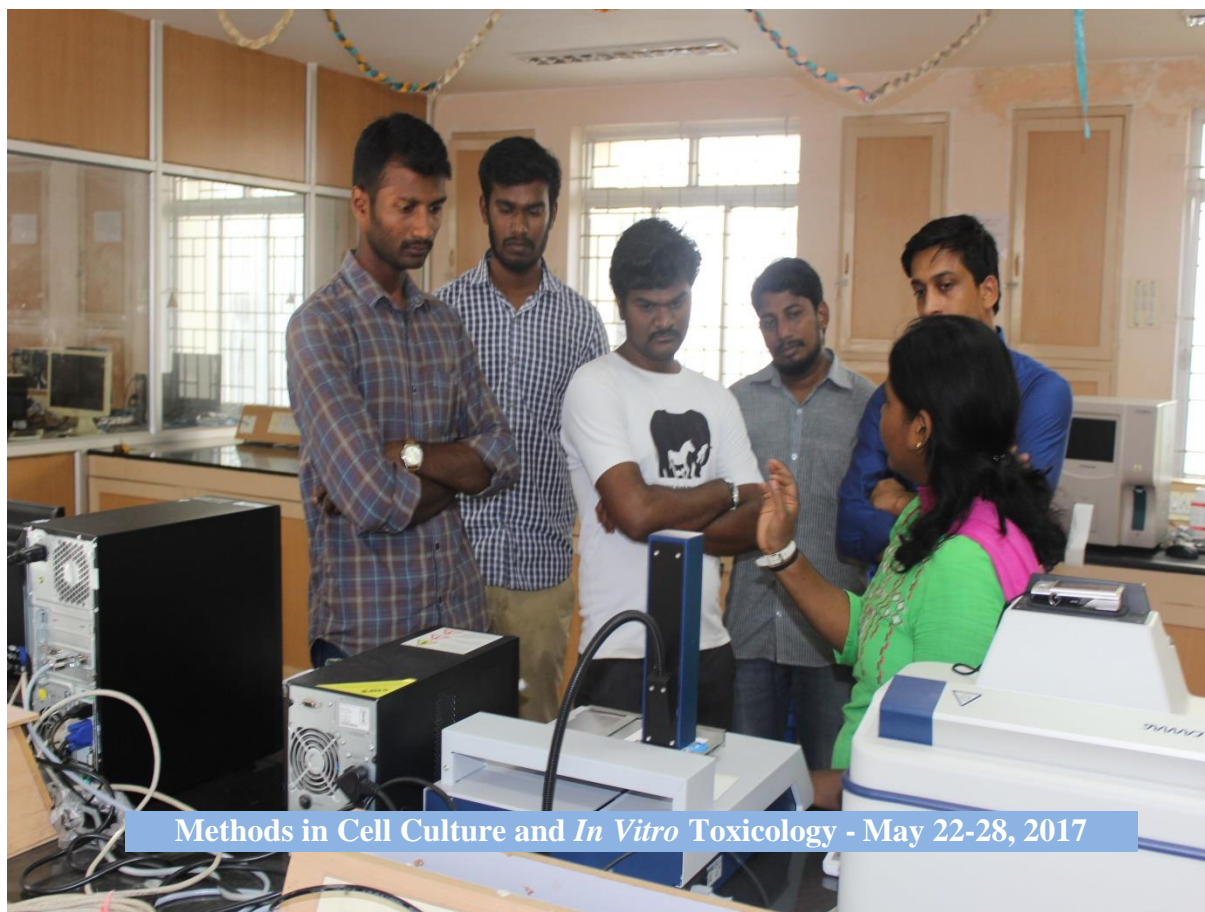
Methods in Cell Culture and In Vitro Toxicology - May 22-28, 2017