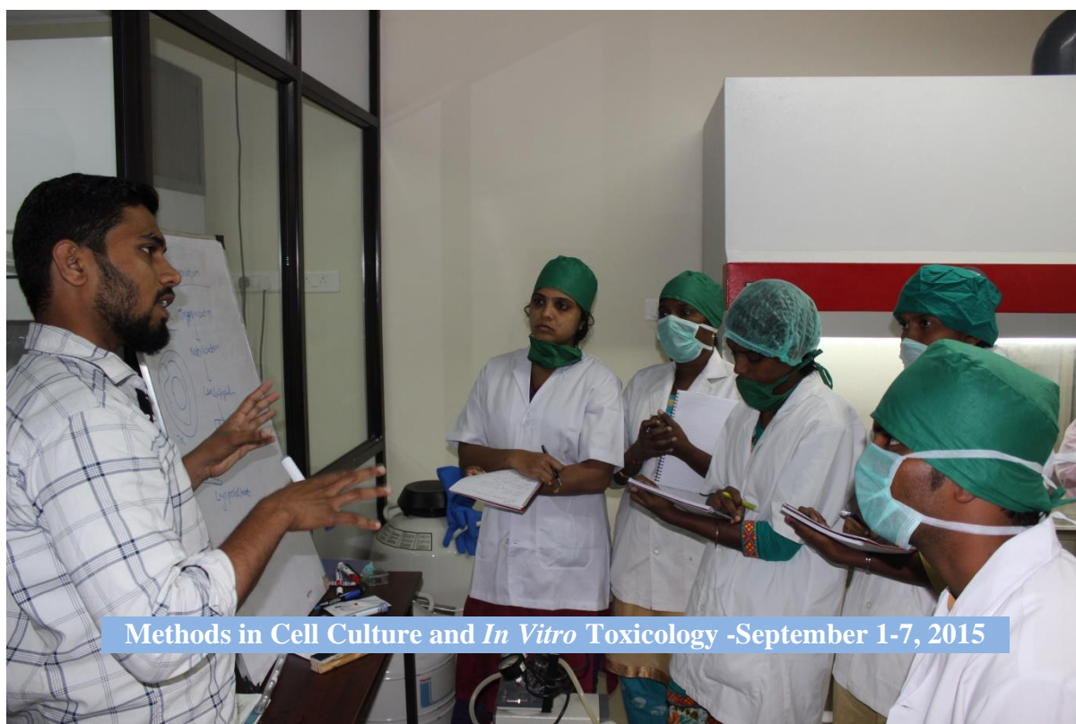
Methods in Cell Culture and In Vitro Toxicology -September 1-7, 2015