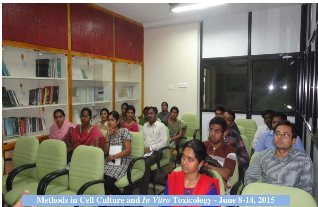
Methods in Cell Culture and In Vitro Toxicology - June 8-14, 2015