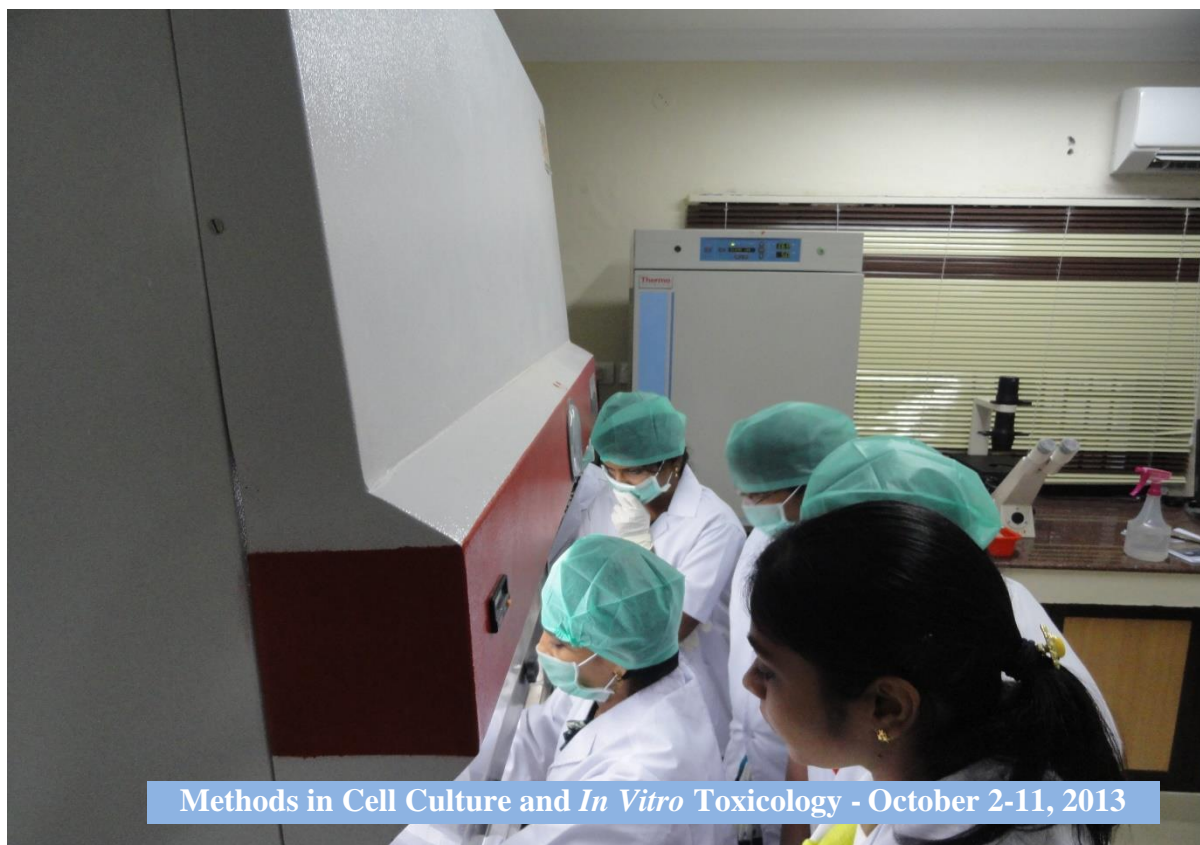
Methods in Cell Culture and In Vitro Toxicology - October 2-11, 2013