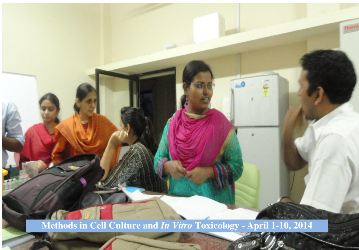
Methods in Cell Culture and In Vitro Toxicology - April 1-10, 2014