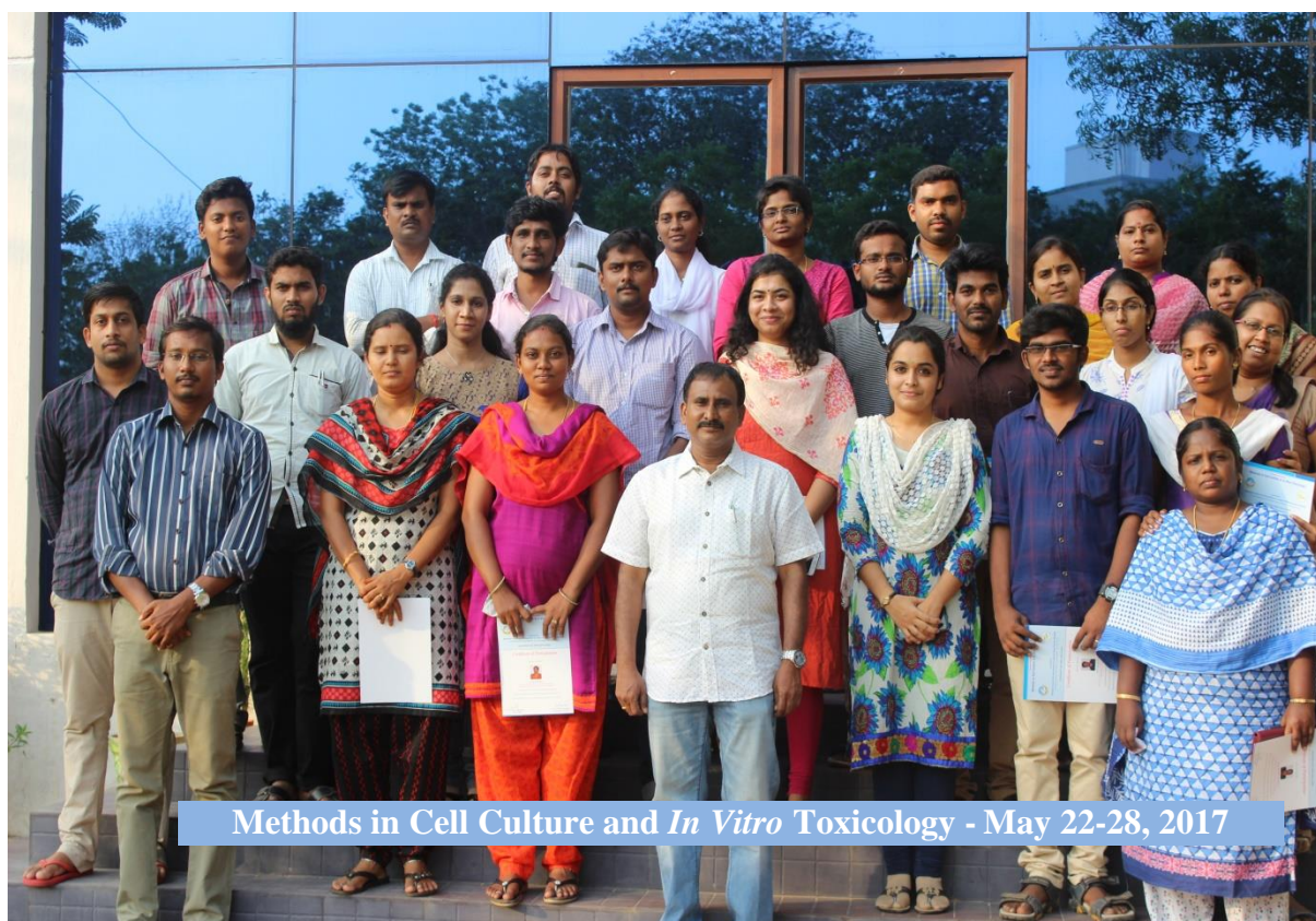
Methods in Cell Culture and In Vitro Toxicology - May 22-28, 2017