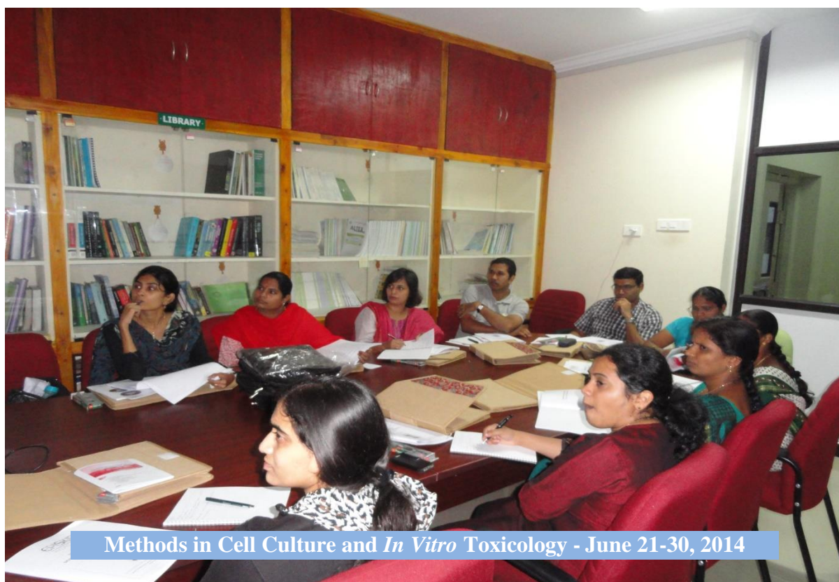
Methods in Cell Culture and In Vitro Toxicology - June 21-30, 2014