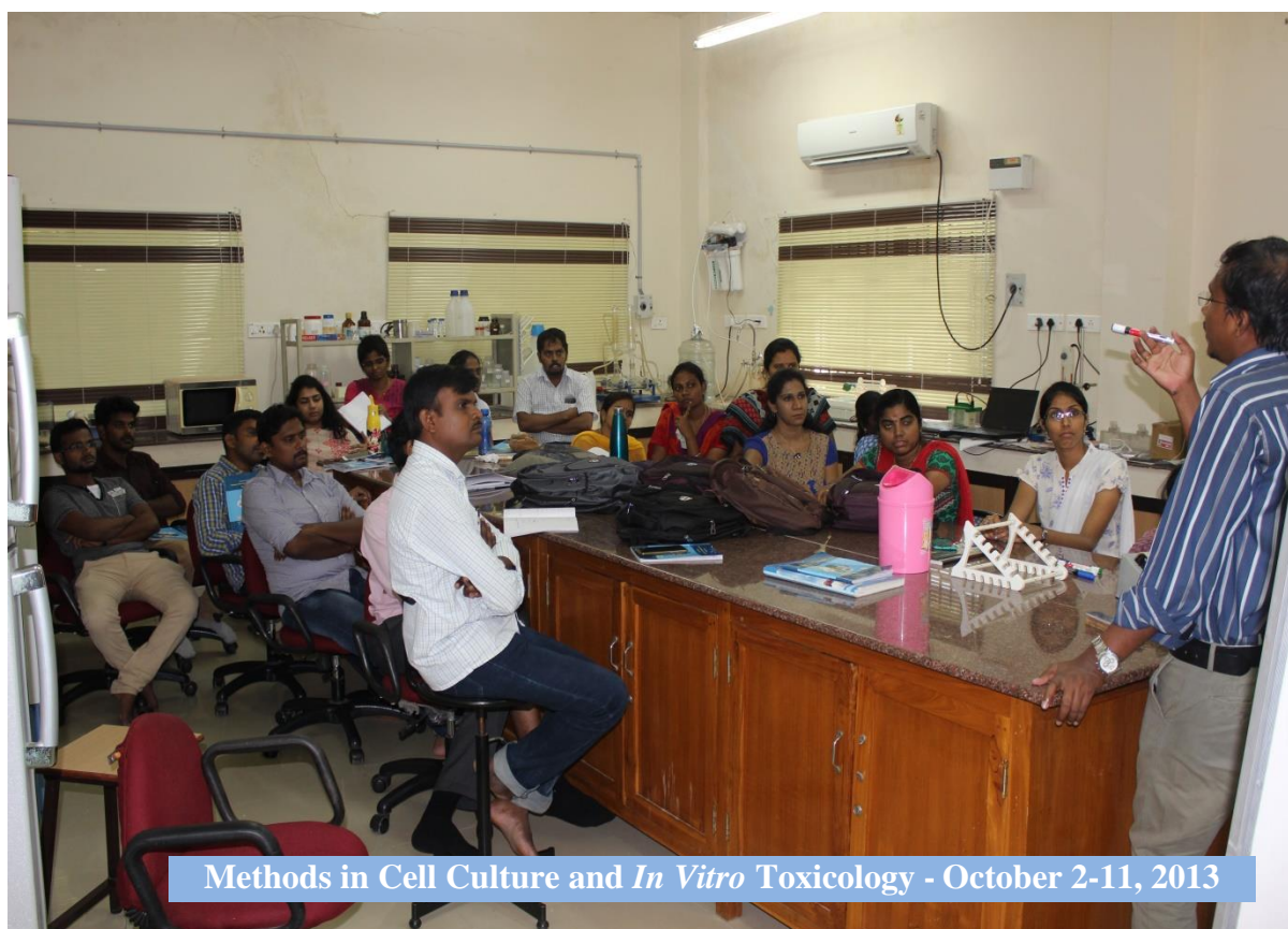
Methods in Cell Culture and In Vitro Toxicology - October 2-11, 2013