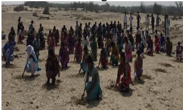
Bharathidasan University Model College, Vedaranyam in association with District Disaster Management, Nagappatinam and Vanam NGO organised a Palm seeds