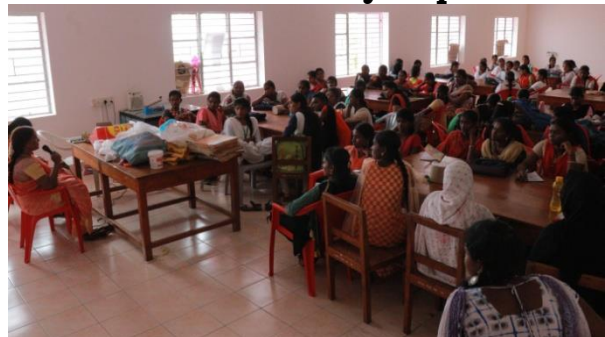
The NSS Cell of Bharathidasan University conducted a two days Workshop on Making of Low Cost Sanitary Napkins for 100 college girls on 15.02.2019 & 16.02.2019 in the